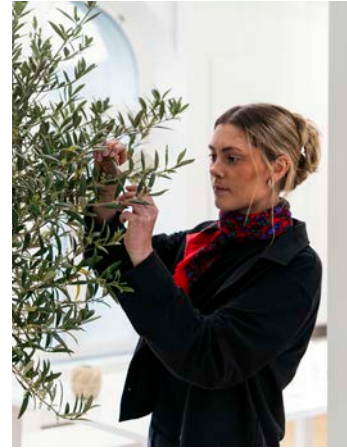
The Wish Tree.

Portland Japanese Garden will be partnering with the Nobel Peace Center, Yoko Ono's studio, and public gardens around the world to feature a global Wish Tree installation. The Wish Tree is an interactive artwork created by acclaimed artist and global peace advocate Yoko Ono. Ono, who was 12 years old and living in Japan when nuclear bombs were dropped on Hiroshima and Nagasaki during World War II, has spent more than six decades rallying for disarmament.