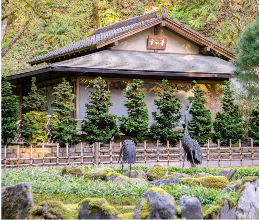
The new hinoki hedges in front of the tea house in the Tea Garden.