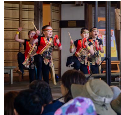
EnTaiko performing at the Garden's Children's Day festival celebration in May.