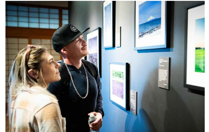
Guests to the Golden Crane Recognition Society Reception for Vision of Place enjoy some of the art in the Pavilion Gallery in March.