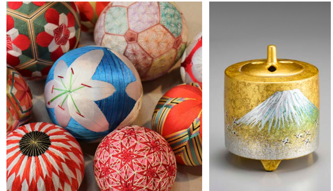
From left to right, examples of the temari and gold leaf incense containers from Kanazawa that will be sold at Behind the Shoji in 2024.

Behind the Shoji opens June 29 in our Pavilion Gallery and runs through September 2. Members and those in the Golden Crane Recognition Society can enjoy a special preview on June 28. For more details, go to japanesegarden.org/shoji-2024