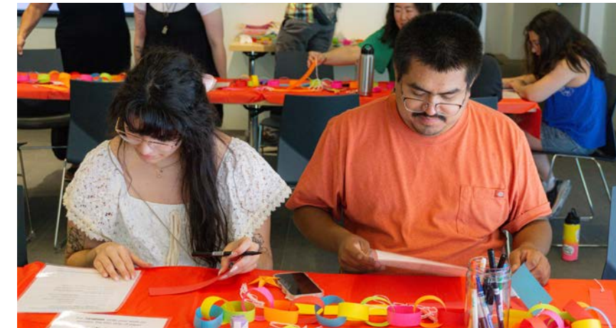
Guests writing on tanzaku , or wish strips, at the Garden's Star Festival Celebration in 2023.

Tanabata , the Star Festival, is one of five seasonal Japanese festivals that has been celebrated since the eighth century. Each summer in Japan, people prepare for the festival by writing their wishes on narrow strips of paper called tanzaku and hanging them with other origami paper ornaments on bamboo branches displayed at the entrance to their homes and public places. Guests attending Portland Japanese Garden's Tanabata celebration will be invited to write their own wishes on tanzaku and enjoy music and storytelling from Takohachi.