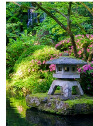
Portland Japanese Garden