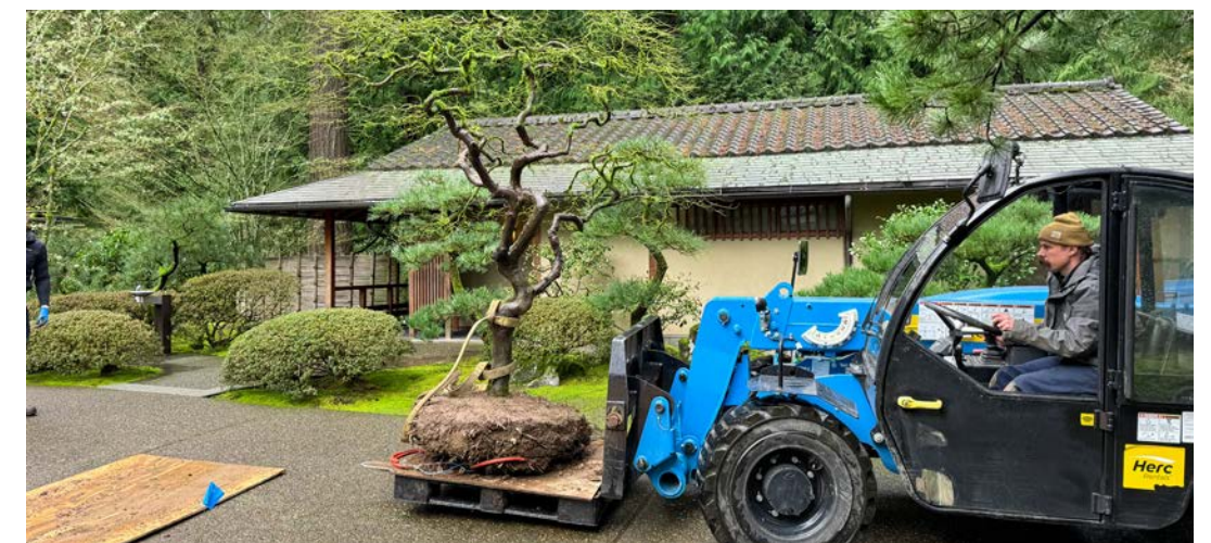
The weeping maple gets escorted to its new home in the Flat Garden.

To learn other places where hinoki can be found in Portland Japanese Garden, go to japanesegarden.org/hinoki