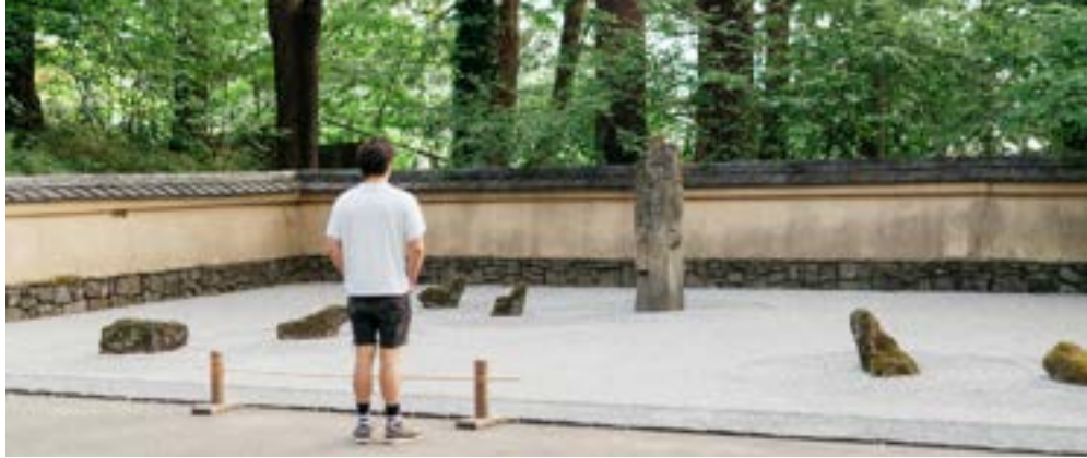
A visitor studies the Sand and Stone Garden in late summer.