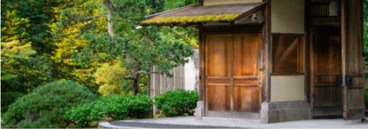
Portland Japanese Garden