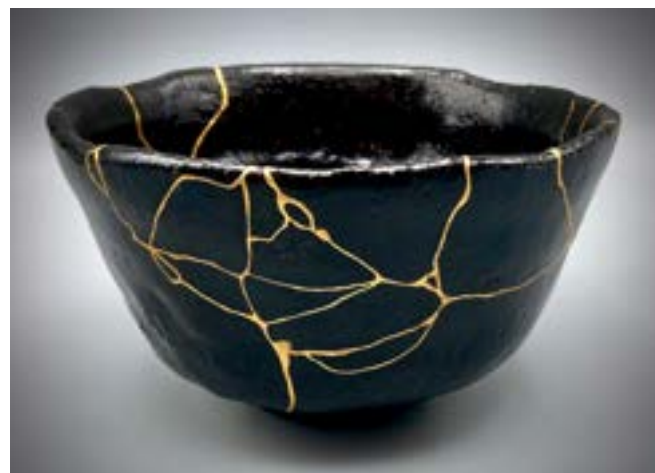
"Timeless Magic," 2023. Taisho era (1912-1926) black Raku ware, urushi lacquer, 24K gold, and resin.