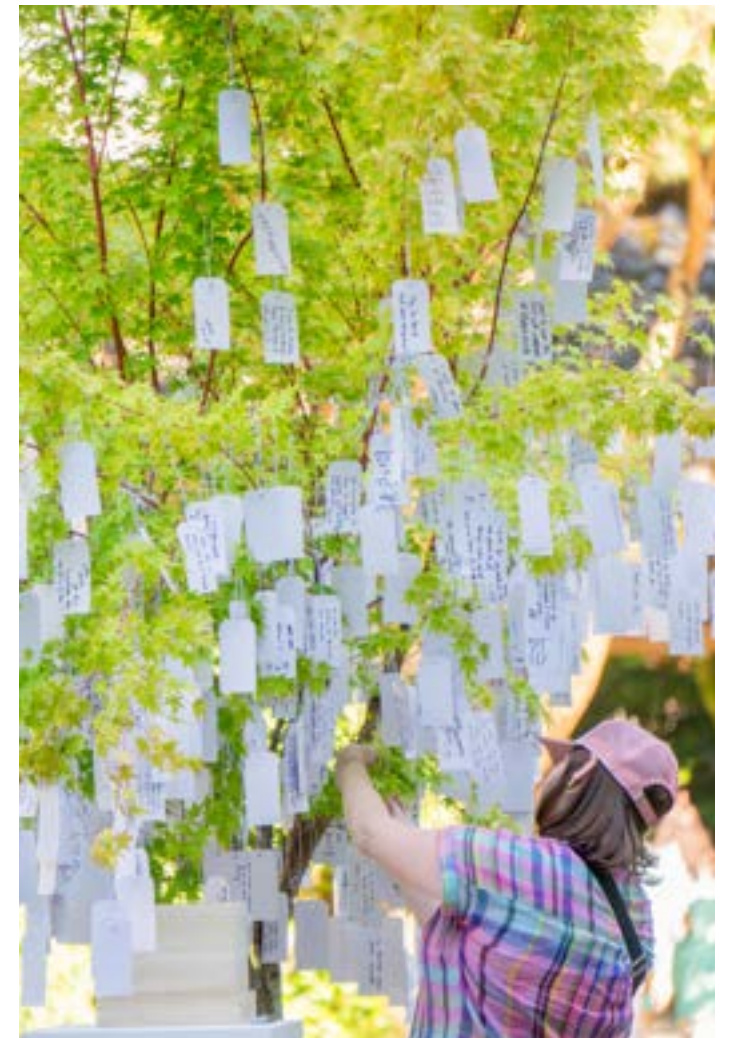
A guest reaches out to put a wish on a maple tree during the Garden's art installation in the Cultural Village in June, SPREAD PEACE: Wish Tree by Yoko Ono.