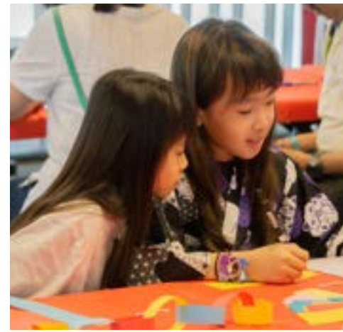
Two young garden guests figure out what wishes they'll write during our Tanabata celebration in July.