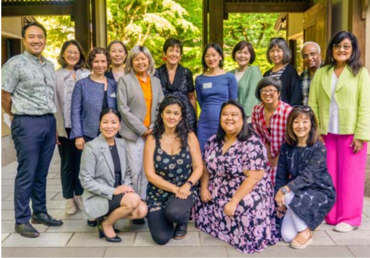
Attendees of Portland Japanese Garden's Asian American Native Hawai'ian Pacific Islander Heritage Month Roundtable Discussion in May.