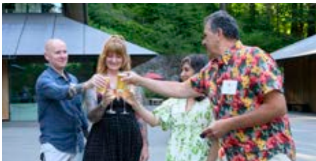
Friends toast each other at the Garden's annual reception for the Golden Crane Recognition Society in June.