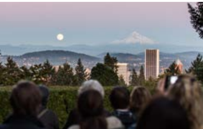
Guests at O-Tsukimi watch the moon rise from Portland Japanese Garden's Mount Hood overlook.

A highlight of summer festivals in Japan is the bon-odori , or bon dance. Each region in Japan has their own version of the dance, as well as different music. In Japanese Buddhist tradition, bon-odori is a way to entertain and send off the spirits of our ancestors and celebrate life. Come learn the dances, see people dressed in yukata (summer kimonos), and to hear and feel the sound of taiko drums at this free Garden event!