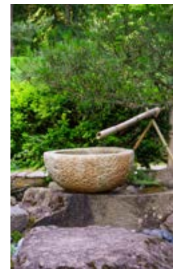
Portland Japanese Garden