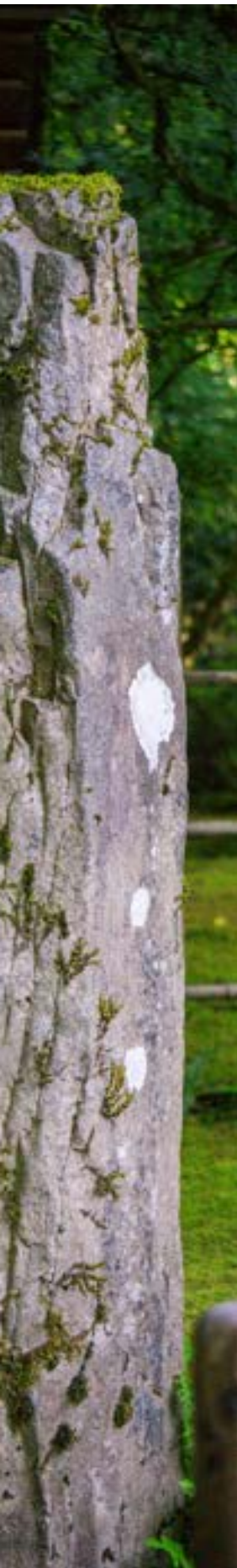
Portland Japanese Garden