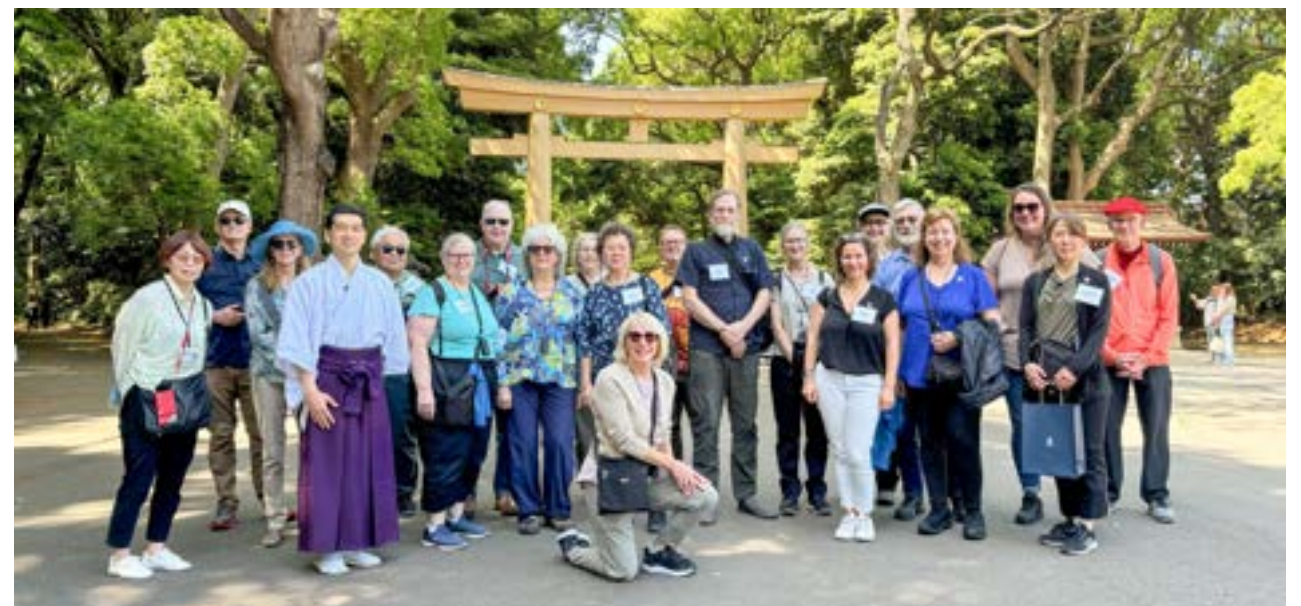
A scene from Portland Japanese Garden's member tour to Japan in May. Here the participants are outside the Meiji Shrine in Tokyo.